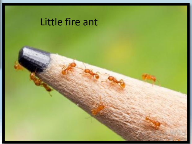
You can't tell just by looking at these five ant species that they cause worse problems than any other ants